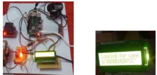
Fig. 2. Shows the output of the proposed system

Since we are using three levels of security in this proposed system the false voters can be easily identified. The facial authentication technique is very much useful in identifying the fraud voters, so we can avoid the bogus votes during election commission [9]. The voters can cast their voting from anywhere by login to our proposed smart voting system through the internet. As every operation is performed through internet connectivity so, it is a onetime investment for the government. Voters' location is not important but their voting is important. As data is stored in a centralized repository so, data is accessible at any time as well as backup of the data is possible. A smart voting system provides an updated result at each and every minute. Also requires less manpower and resources. The database needs to be updated every year or before the election so that new eligible citizens may be enrolled and those who died are removed from the vote list [6].